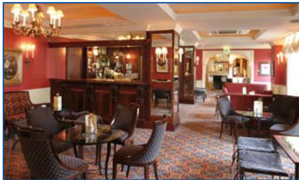
The Lounge Bar

Stratford-upon-Avon, Warwickshire CV37 6YT