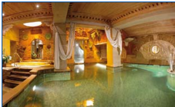
The Roman Spa