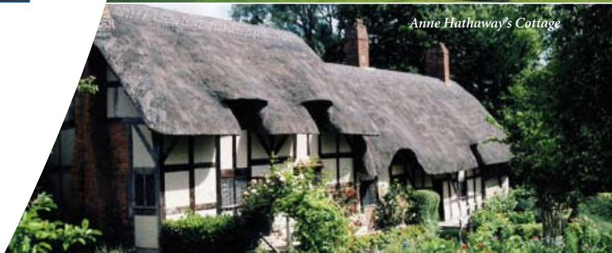
Anne Hathaway's Cottage