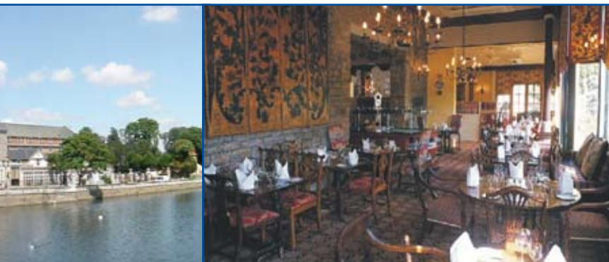
The River Room Restaurant

Best Available Rate From: £59.50 see inside back cover for more details