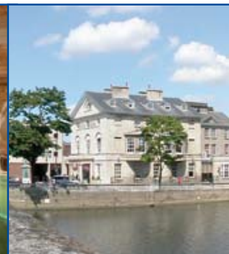
The Bedford Swan Hotel

The Bedford Swan Hotel occupies a prominent position in the very centre of the historic town of Bedford yet overlooking the River Ouse which gracefully meanders through the Bedfordshire countryside.