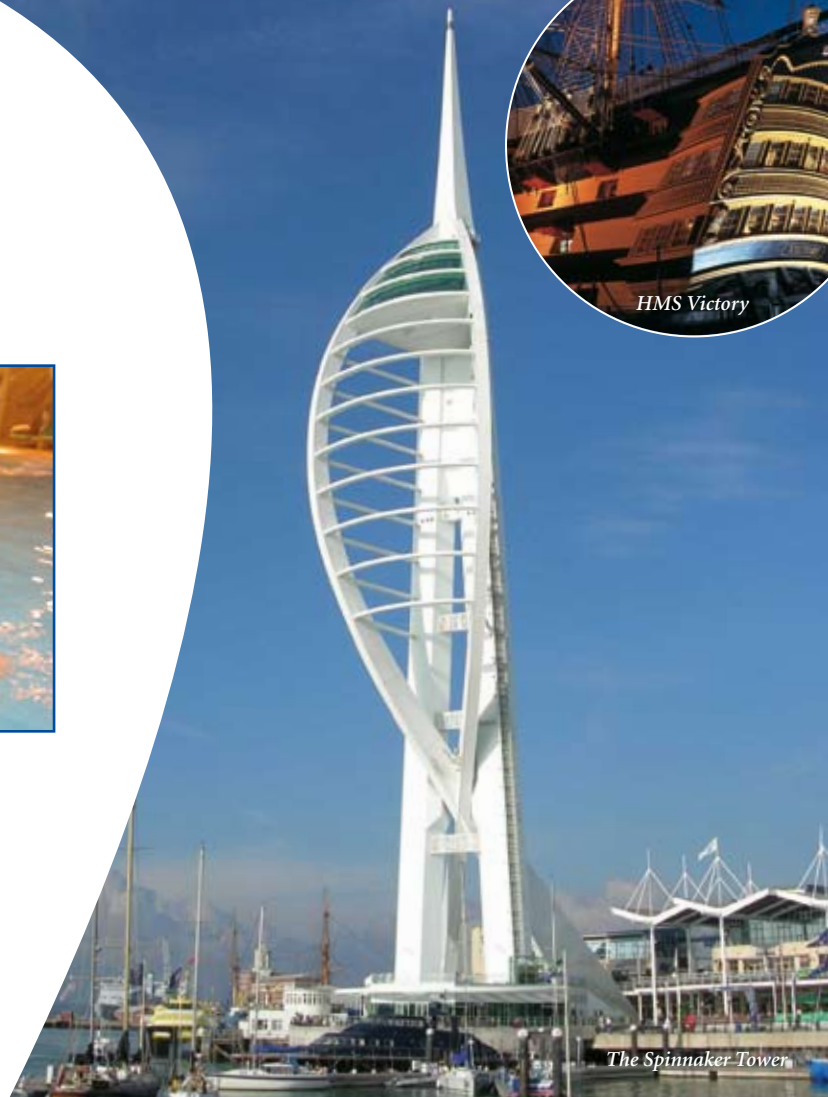
The Spinnaker Tower