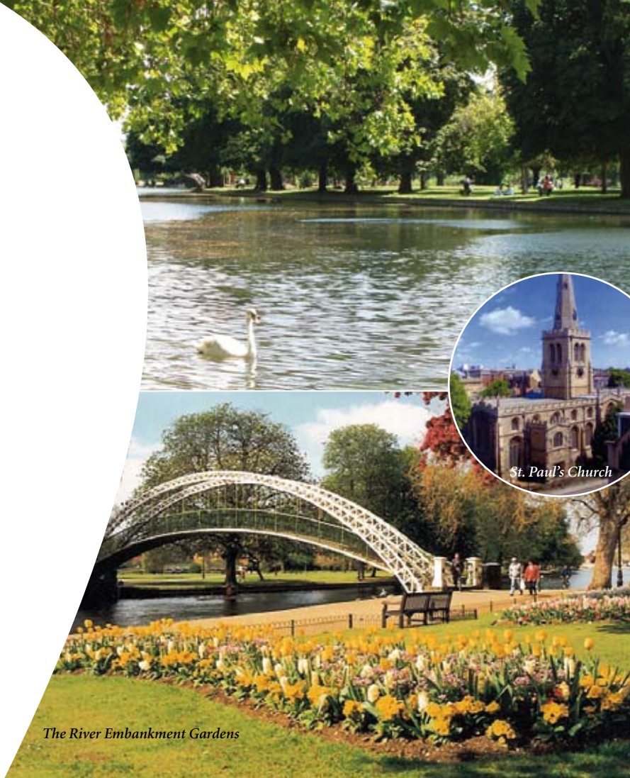
The River Embankment Gardens

include Althorp House, the resting place of Diana, Princess of Wales, as well as Woburn Abbey, Whipsnade Zoo and Knebworth House. Silverstone Race Track is a little bit further and the historic university cities of Oxford and Cambridge are within an hour's drive. Central London is only 40 minutes by train whilst in Bedford, you will find the Cecil Higgins Art Gallery and the Bedford and Bunyan Museums well worth a visit.