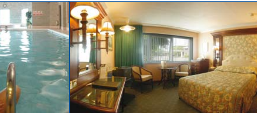
A Double Room

Best Available Rate From: £49.00 see inside back cover for more details