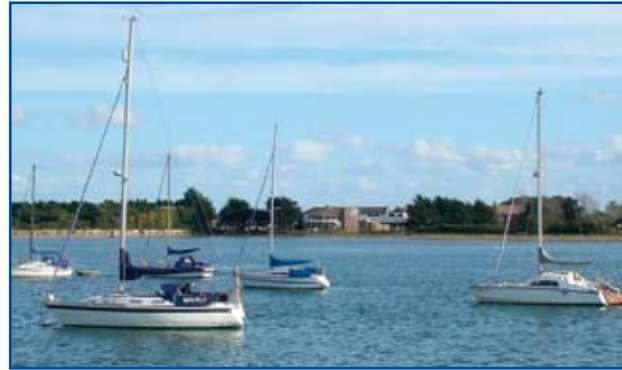
The Langstone Hotel

Hayling Island, Portsmouth, Hampshire PO11 0NQ