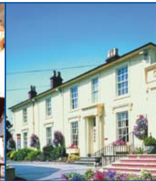
Best Western Grosvenor Hotel

The Best Western Grosvenor Hotel is a distinctive Grade II listed Georgian hotel ideally located less than five minutes walk from the centre of the historic Shakespearian town of Stratford-upon-Avon.