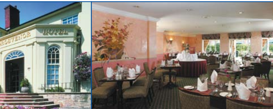
The Garden Room Restaurant

Best Available Rate From: £50.00 see inside back cover for more details